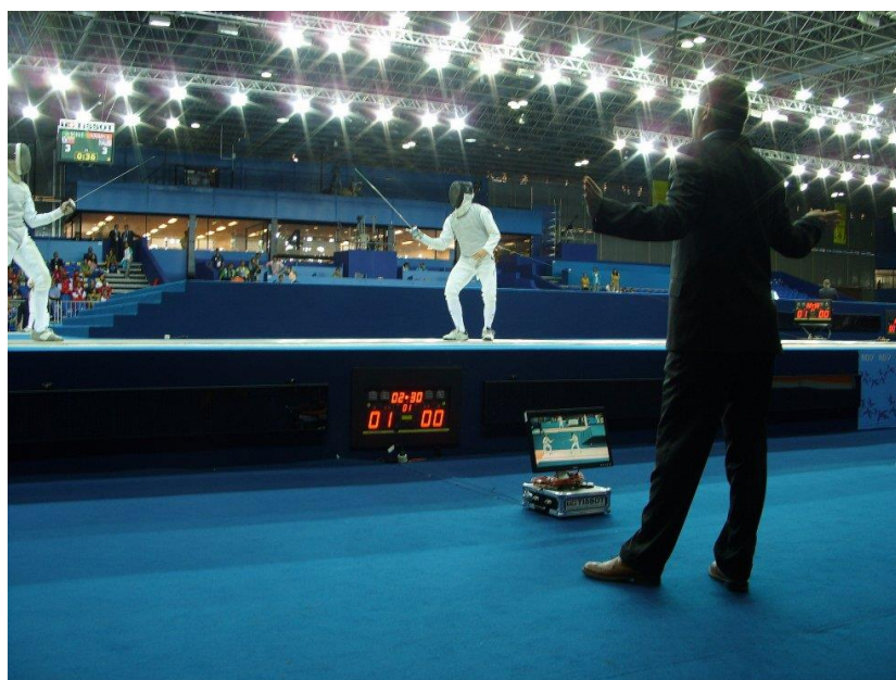
Figure 1: Review screen of the main referee

The video replay system must be capable of being set up and operated on at least 4 pistes plus the Finals piste. The video is produced in high definition with a native 16:9-Resolution of minimum 720 rows. Standard formats include 720p, 1080i and 1080p. The cameras need to be able to record 24 full pictures per second. The cameras need to be aligned to ensure that they can cover the entire Fencing piste at any time. Due to different conditions at the indoor arenas and to keep a clear Field of Play, the distance between camera and Fencing piste could be up to 50m and more. Video recording, processing, and video output shall exclusively in HD. Each Fencing piste equipped with video replay needs to feature at least 1 review monitor for the Referees. This monitor is to be set up centrally in a distance of approx. 2m from the piste. In addition, the main Referee needs to have free sight onto the monitor. The monitor needs to have a screen diagonal of at least 19” with a minimum resolution of 1280 rows.