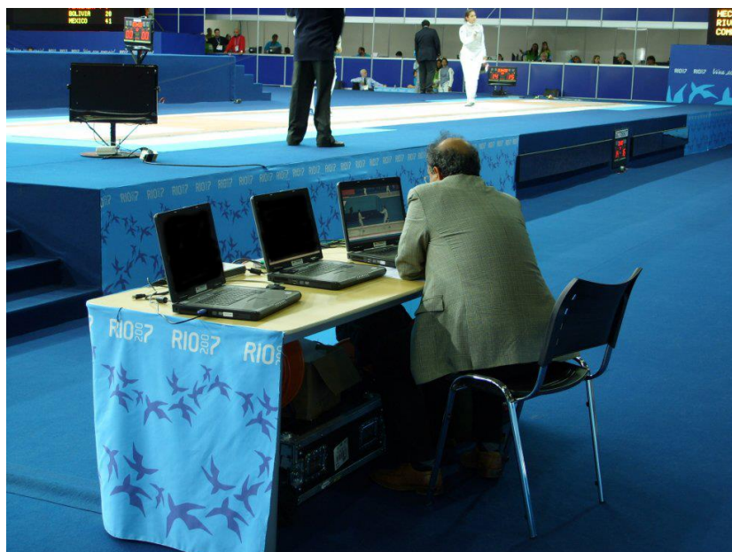
Figure 2: Sample setup of a video referee workplace covering 3 pistes

Using the video system must not imply any disadvantages, delays or hindrance to the athletes and common processes of the entire competition.